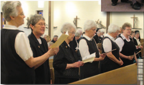
Sisters renewing vows during mass