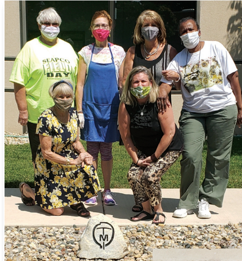
A gift to the sisters from employees after their return to work this May.