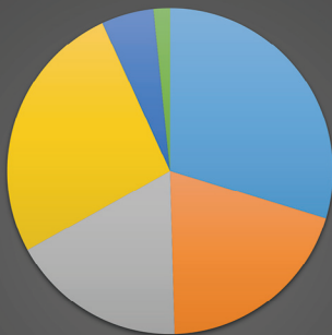
Donor Gifts Totaling $372,502.48 July 1, 2019 – June 30, 2020

From then on the beautiful autumn leaves remind me of how good God is to create such beauty for us to enjoy. My gratitude to God for the gift of trees has expanded beyond autumn to include the dormant trees of winter, which are so gorgeous after a snowfall. In the spring, as the trees begin to bud, they speak to me of the miracle of new life, and then in the summertime we can enjoy the fruit and shade and flowering of trees that are gifts from our loving Creator. So yes, Dad, you were right – only God can do that!