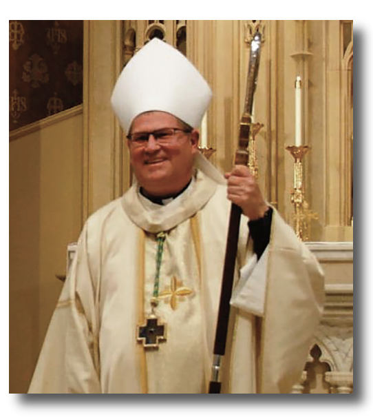
Two of our sisters were delighted to attend the social-distanced ceremony which was also live-streamed for all to witness.