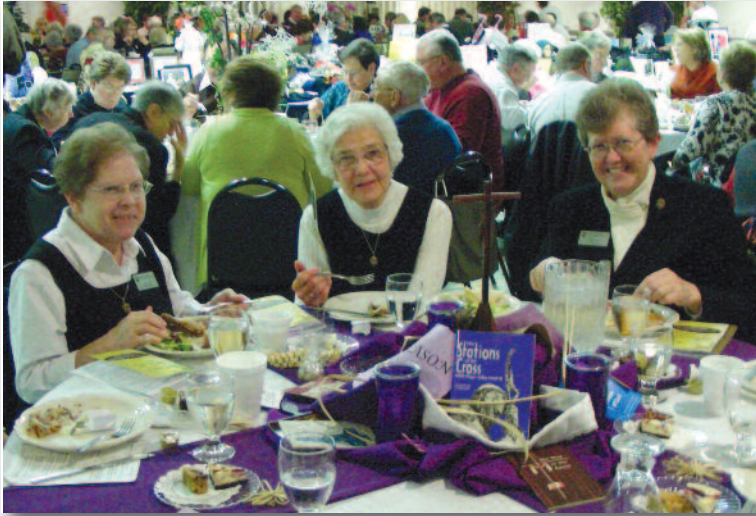
The sisters enjoying the evening.